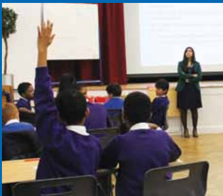
THE YEAR 7 'A TEAM' WORK WITH PRIMARY SCHOOL STUDENTS IN A FIRST WORLD WAR POETRY WORKSHOP