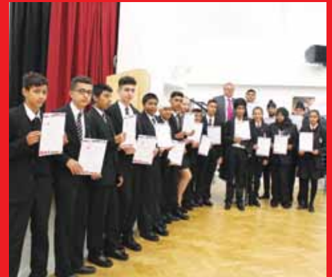
YEAR 10 STUDENTS RECEIVED BRITISH AIRWAYS AWARDS FOR THEIR LANGUAGE SKILLS