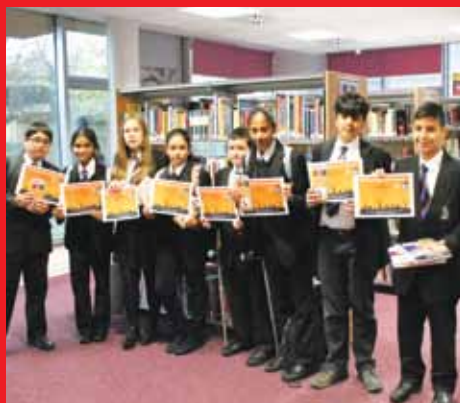
YEARS 7 & 8 WROTE TERRIFYING TALES IN THE SPOOKY STORY COMPETITION