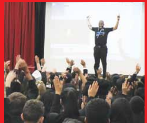
ACTION JACKSON ATTENDED A YEAR 11 ASSEMBLY TO INSPIRE & MOTIVATE STUDENTS IN THEIR GCSE YEAR