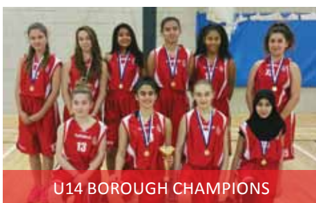
U14 BOROUGH CHAMPIONS