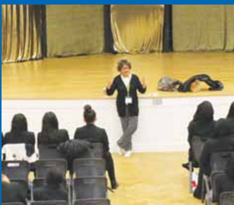
JOURNALIST & AUTHOR YASMIN ALIBHAI-BROWN ENCOURAGES YEAR 10 TO PURSUE THEIR DREAMS