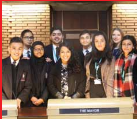
YEAR 9 & 12 STUDENT TEAMS IMPRESS IN THE ROTARY YOUTH SPEAKS COMPETITION