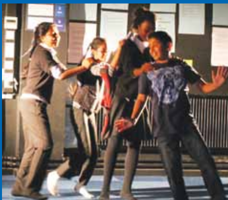
THE MUSICAL THEATRE EVENING WAS FULL OF SONGS & DANCE FROM MUSICALS & DISNEY FILMS