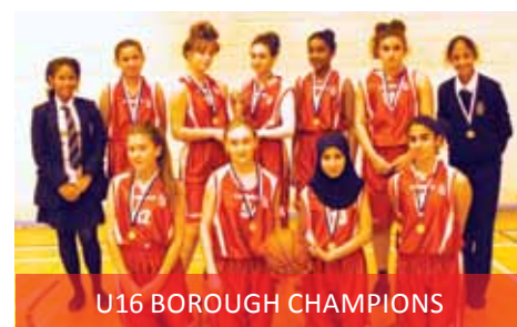
U16 BOROUGH CHAMPIONS

Congratulations to our U14 and U16 Girls' Basketball teams who have both been crowned Borough champions and now go on to represent Hounslow in the London Region tournament. We are also delighted with the progress of our Year 7 team who are competing in the new Junior NBA league as the Dallas Mavericks.