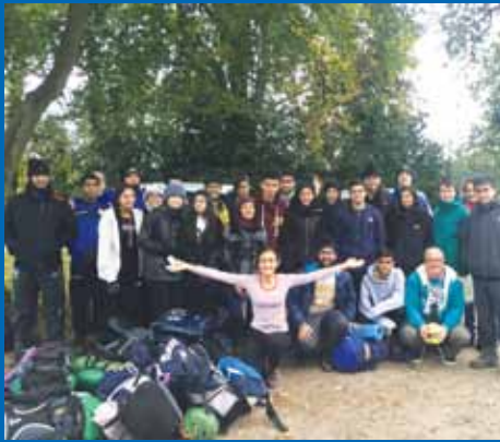
D OF E STUDENTS SUCCESSFULLY COMPLETED THEIR BRONZE EXPEDITION IN BUCKINGHAMSHIRE