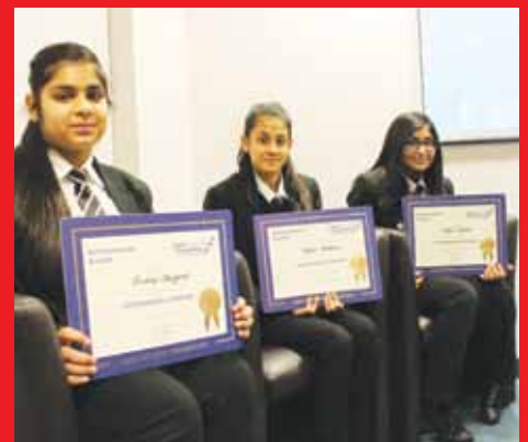
WELL DONE GIRLS – JACK PETCHEY WINNERS FOR AUTUMN TERM WITH THEIR CERTIFICATES