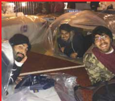
SIXTH FORM STUDENTS SLEEP OUT TO RAISE MONEY FOR TRINITY TO HELP THE HOMELESS