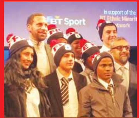
AS PART OF THE BT MENTORING SCHEME YEAR 11 STUDENTS HAD AN EVENING WITH RIO FERDINAND