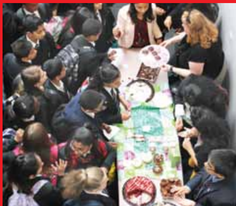
"BETTER THAN THE GREAT BRITISH BAKE OFF" – A CAKE SALE FOR MACMILLAN CANCER SUPPORT