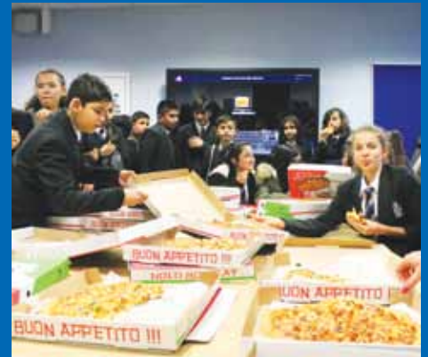
A LUNCHTIME PIZZA PARTY & ACHIEVER AWARDS FOR STAR STUDENTS IN YEARS 7, 8 & 9