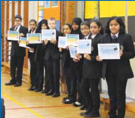
ENGLISH AWARDS HAVE BEEN PRESENTED TO ALL YEARS FOR EFFORT & ACHIEVEMENT – HERE ARE YEAR 7