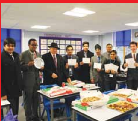
SIXTH FORM MATHS STUDENTS ARE TREATED TO PIZZA TO CELEBRATE THEIR RECENT AWARDS