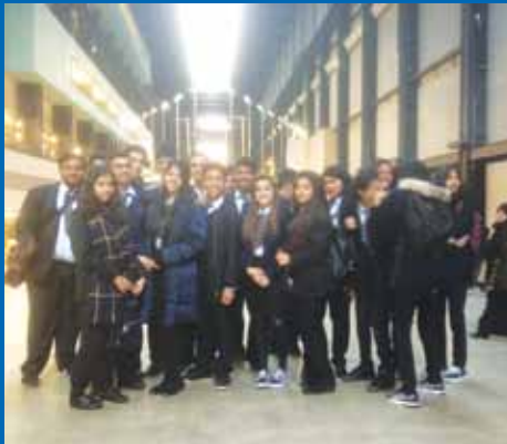
YEAR 11 ART STUDENTS VISIT TATE MODERN TO RESEARCH GCSE ART PROJECTS