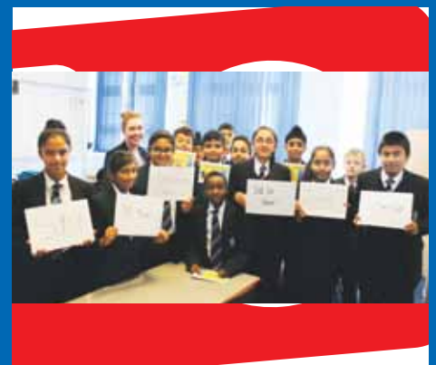
YEAR 7 STUDENTS WERE CHALLENGED TO SAY HELLO IN AS MANY LANGUAGES AS POSSIBLE