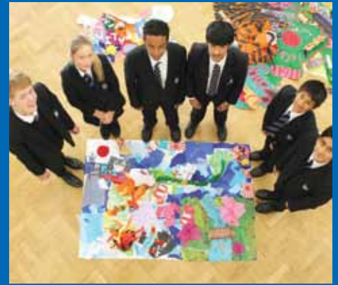
SUPER LEARNING DAY SAW STUDENTS "RE-MAKE THE WORLD" WITH SUPERB 3D MAPS