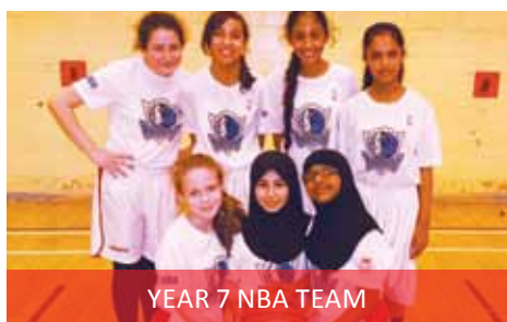
YEAR 7 NBA TEAM